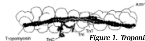
Figure 1. Troponin

Cardiac muscle function occurs as a result of interactions between protein filaments that bind and slide together. In order for the filaments to bind together and, thus, muscle contraction to occur, the protein complex troponin must be activated. Troponin (Tn) is composed of three subunits: cardiac troponin C (cTnC), cardiac troponin I (cTnI), and cardiac troponin T (cTnT) (see Figure 1).